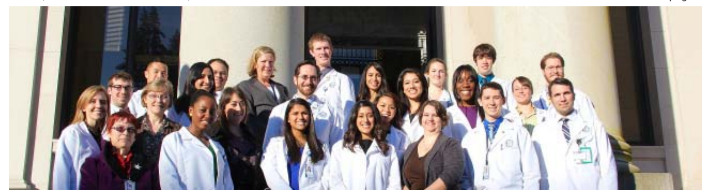
Several of the WOMA members and PNWU students participating in DO Day in Olympia assemble for this Kodak moment at the end of the day.